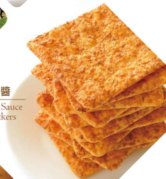
噴醬 Spray Sauce Crackers