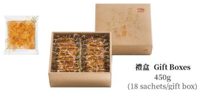
禮盒 Gift Boxes 450g (18 sachets/gift box)