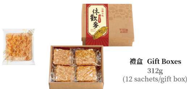
禮盒 Gift Boxes 312g (12 sachets/gift box)